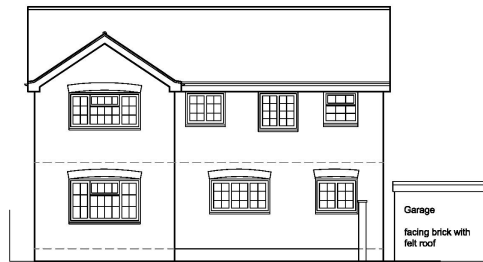
Existing east elevation

materials: Concrete panellie rooflights PVC windows & door with brick on end heads black PVC rainwater goods to match existing Facing brick walls