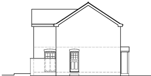
Existing north elevation